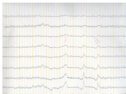
Fig. 4: Postoperative EEG showing sharp waves at the level of the trachea

Sleep disorders can exacerbate the seizures in epileptic patients [22]. Dominici et al [23] stated that treating the sleep apnea will also decrease the frequency of epileptic seizures. Sleep fragmentation caused by respiratory disorders induces daytime sleepiness, migraine and attention deficits. In epileptic patients, apnea may facilitate seizures [23]. OSA occurs as the result of frequent narrowing of the upper airways during sleep. The patients are often overweight and have peripharyngeal fat [16] and enlarged tongue and soft palate [17]. Also, OSA occurs in some patients because of the problems associated with the jaws, such as micrognathia or retrognathia, which decrease the tongue space. These anatomical abnormalities reduce the cross-sectional area of the upper airway [14]. Reducing the tonicity of the airway muscles and increasing the gravitational pull in the supine position facilitate the normal air flow during breathing [14]. Partial obstruction of the airways may result in snoring, and there is a possibility of a complete obstruction in the supine position. A partial obstruction (hypopnea) or a complete apnea awaken the patient from sleep.