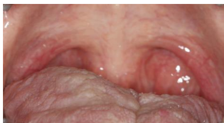
Fig. 1: Preoperative intraoral view of the soft palate

A study of 269 patients treated with UPPP showed that the success rate of this surgery is 59% with a simultaneous tonsillectomy and 30% without tonsillectomy. The long-term success rate was 60.5% after 3 to 12 months and 47.6% after 3 to 7 years of follow-up [10].