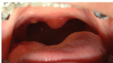
Fig. 3: Postoperative intraoral view of the soft palate