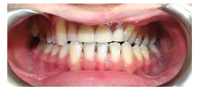
FIGURE 6 Intraoral view of the final overdenture

Tooth setup was performed again in the presence of framework and attachment, and tried-in. It was then waxed up and processed using heat-polymerizing acrylic resin (Meliodent; Heraeus Kulzer) (Figure 5). The overdenture was tried-in, and its extension, occlusion, and patient's speech were evaluated (Figure 6). The overdenture significantly improved the patient's speech and esthetics. The follow-ups were scheduled