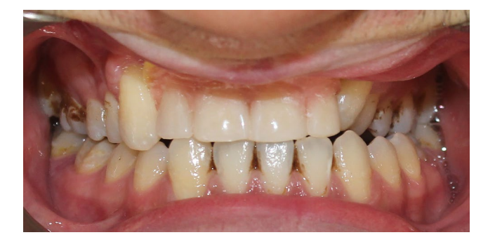
FIGURE 3 Tooth setup try-in