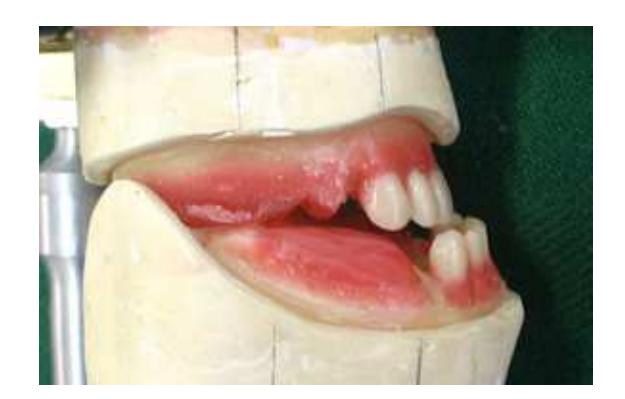
Fig 2. Anterior tooth set-up in class III occlusion