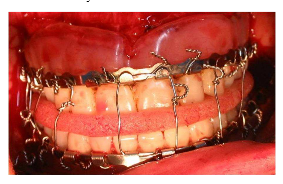
Fig 6. Fixing the final splint with an arch bar for stabilizing the maxilla and the mandible after surgery. An intermediate splint was sited between the two jaws

The surgeon opened the arch bar and performed mandibular sagittal split osteotomy. The final splint was fixed by arch bar (Figure 6) then mandibular fixation was performed in that position by screws. The deficient alveolar ridge in the premaxilla and mandible was augmented by autogenous iliac bone graft harvested during the orthognathic surgery.