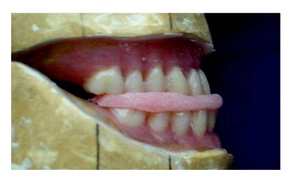
Fig 4. Intermediate splint was made with self cure acrylic resin in the articulator