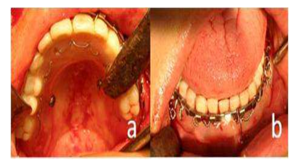
Fig 5.Fixing final splints with screws in the maxilla (a) and circummandibular wiring in

There are multiple factors involved in denture stability. For instance, theanteroposterior relationship of the maxilla and mandible affects the stability of denture.