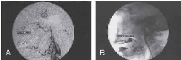
Fig 2 (A) Left lateral radiographic projection demonstrating the microcatheter injection into the right internal maxillary artery. The central collection of contrast indicates a pseudoaneurysm. (B) Postembolization view.

was started. On the third day after surgery, the patient was discharged in good general condition. On the tenth day, in the bathroom, she had nose bleeding that stopped spontaneously. She was referred to the emergency room of the hospital and anterior nasal packing was performed. After 2 days, the packing was withdrawn; 48 hours later, nasal bleeding began again during bathing but stopped before the patient reached the hospital.