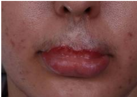
Fig. 7: Wound healing of flaps are acceptable and the patient is ready to divide the flap pedicles and to open the mouth.

Then the patient was extubated and N/G tube was removed and topical antibiotic was applied on the lips. A second operation was performed to dissect each flap from its pedicle after 10-14 days (Figure 7). This operation was performed under deep sedation. Note that the first cut was done on coverage flap. Then the mucosa between the two lips was dissected under a beveled cut. Then inserting of flaps was completed and suturing of the flaps was performed (Figure 8). Schematic presentation of whole procedure is provided in Figure 9.