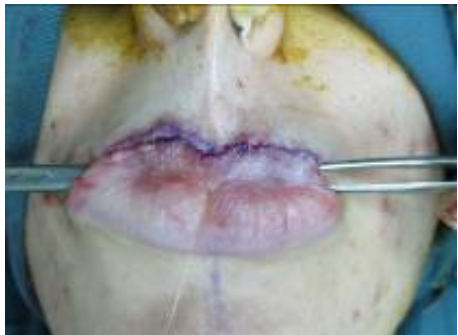
Fig. 5: Donor flap sutured to the recipient site (upper lip).