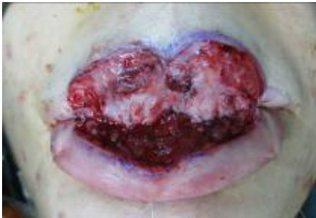
Fig. 4: The defective lip flap sutured the bed of the donor flap.

donor site of the donor lip was repaired by diseased mucosa of the defective lip mutually, which used to be discarded in other methods. This was as if a lining flap and a coverage flap are placed on each other. In Figure 6, a surgical instrument was cross-passed underneath the two flaps and another instrument was passed between the two flaps to help better understanding of the procedure. In total or near total situations, both mouth commissures were open, which could be used for patient's hygiene and nutrition purposes.