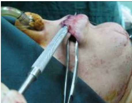
Fig. 6: Both flaps were insetted to be transferred. Each surgical instrument was inserted underneath of each flap.

Then the patient was extubated and N/G tube was removed and topical antibiotic was applied on the lips. A second operation was performed to dissect each flap from its pedicle after 10-14 days (Figure 7). This operation was performed under deep sedation. Note that the first cut was done on coverage flap. Then the mucosa between the two lips was dissected under a beveled cut. Then inserting of flaps was completed and suturing of the flaps was performed (Figure 8). Schematic presentation of whole procedure is provided in Figure 9.