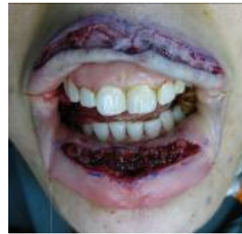
Fig. 3: Both flaps are ready to transfer.

Then, defective lip flap edge was sutured to the opposite lip mucosa donor defect edge near the depth of vestibule with vicryl 4.0 or 5.0 (Figure 4). Next, the normal lip flap was directly sutured to the edge of the skin of the defective lip (Figure 5). Therefore, in the proposed method the defective side was repaired by a flap from the normal side. In this method, the