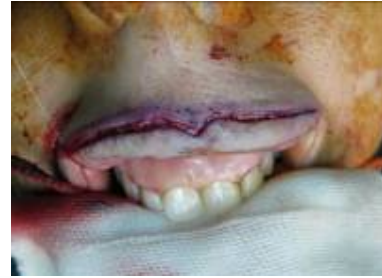
Fig. 2: Incision and flap preparation of upper lip to prepare the bed for transfer of the cross lip flap.

oral mucosa of the lip). This was done in such a way that the sutures at donor side to be invisible in repose or speaking situations after cutting and inserting of the flap. This time, musculomucosal flap dissection was performed at the depth of vestibule towards outside with 1.5 to 2 mm thickness (Figures 3).