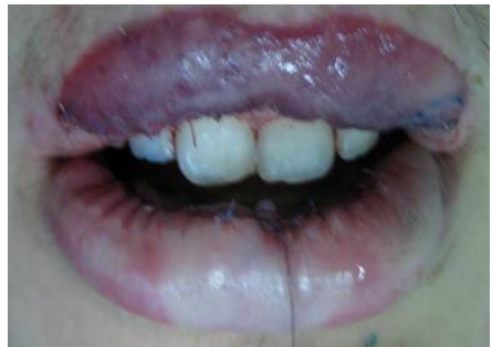
Fig. 8: The pedicles were divided and complete inset of flaps were performed.

After cutting pedicles of the flaps, good oral hygiene should be maintained. The patient was encouraged to keep the new lips moist for several weeks as they were exposed to the air and sun. This surgical operation can be performed individually or in combination with other operations. As it can be seen in our cases, in three of them the operations were done along with genioplasty surgery and in one case in combination with fat injection (Figures 10-13).