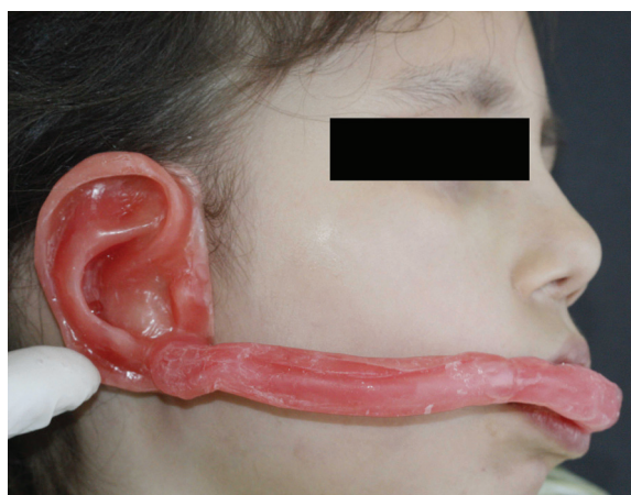
Fig. 2: Waxed up ear trying in.

acoustic meatus. Its direction was determined through the holes which were prepared on the splint before surgery, and the temporal bone was exposed. In order to prevent osteocytes get damaged and providing direct contact between implant and bone (osseointegration), the surgeon must apply a gentle technique. 9 To achieve the most desired implants angulations and placements and adequate spacing, the surgeon used surgical template. Furthermore, to assure the sufficiency of bone volume for implant placement, bone quantity was evaluated at the time of surgery. Under general anesthesia, two implants; 3.3/5.5 mm (ITI, Straumann AG,