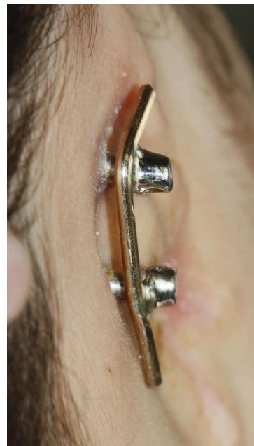
Fig. 5: Bar retention clip system.

By using dental wax or modeling clay or both of them, the prosthetic ear was sculpted on the model. To make sure of the right dimension of the sculpted ear and its compatibility with patient facial features, the sculpted ear was tried on the patient. The mold was packed with silicone rubber, which is the material of choice for most maxillofacial prosthesis at the moment. After polymerization of the silicone, the prosthesis was finished with abrasive wheels. Extrinsic coloring was added to the prosthesis with the patient present so that the color, hue and tone of the patient's skin could be matched perfectly. The prosthesis was then placed on the patient (Figure 6). The prosthesis could be used constantly and there was no need for rinsing.