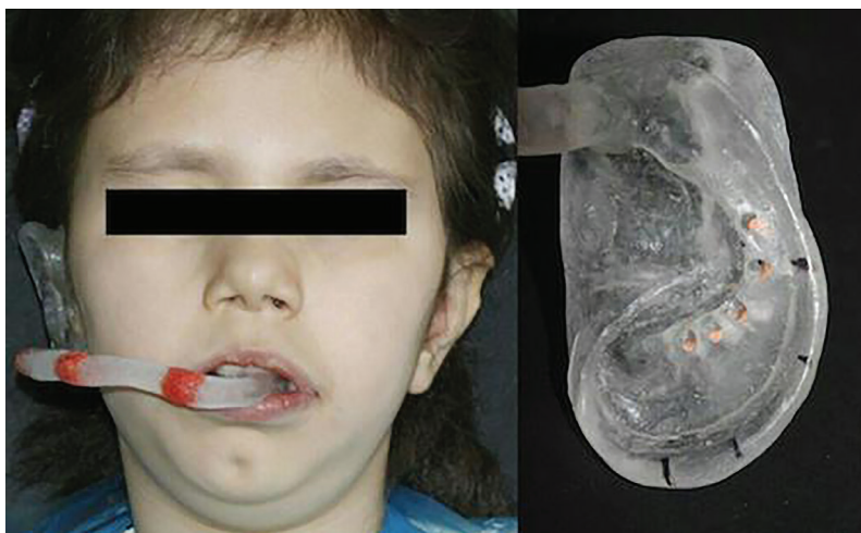
Fig. 1: A. 12-year-old female patient with right ear loss. Initial clinical presentation. B. anterior view.

An incision was made posterior to external